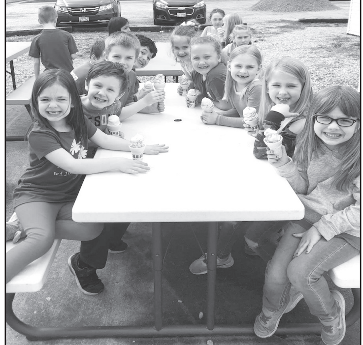
Villa Grove Students ventured over to the Scoop for Autism Awareness and enjoyed blue ice cream.