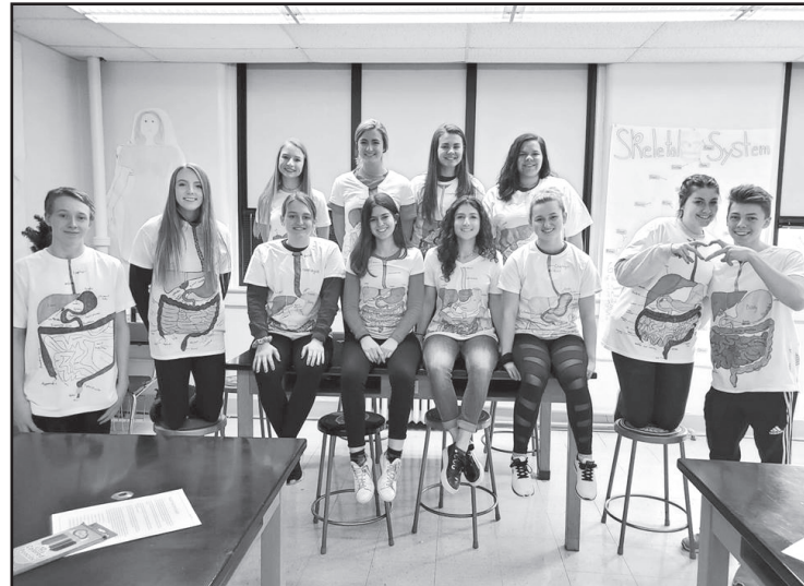
Villa Grove Anatomy students created t-shirts to show the human body digestive system.

Photo to Left and Photo Below: BVG Crew tackled Henson Park on Saturday, April 6. Together the group raked, cleaned, scraped and painted, getting the park ready for opening day.