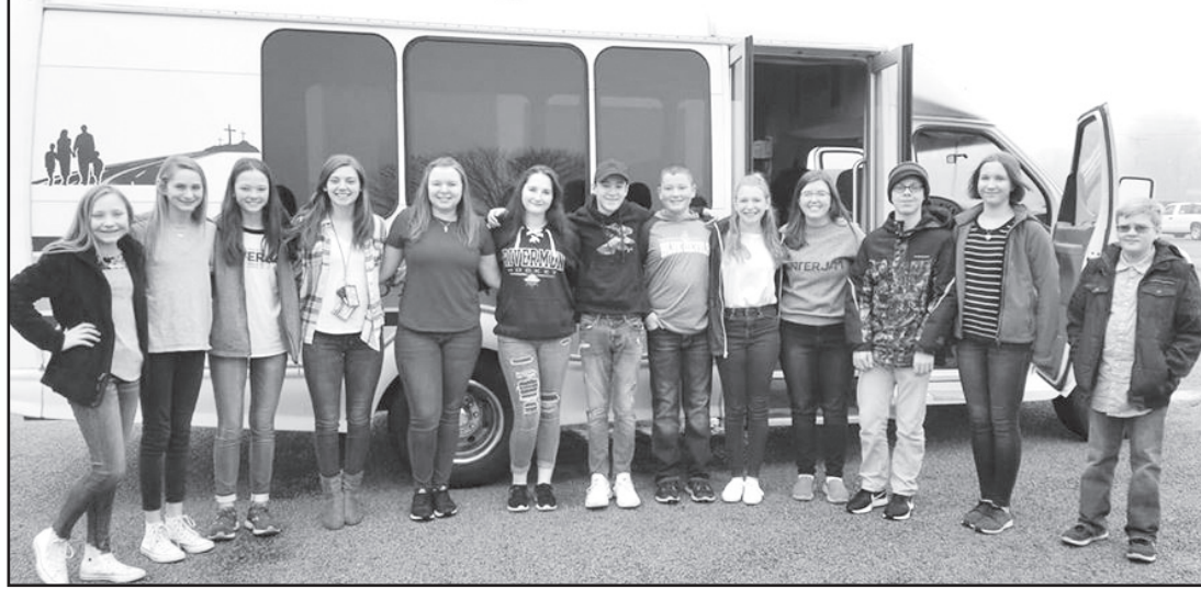
Local youth of the First Christian Church of Villa Grove attended WinterJam in Indianapolis at Bankers Life Fieldhouse on March 29th