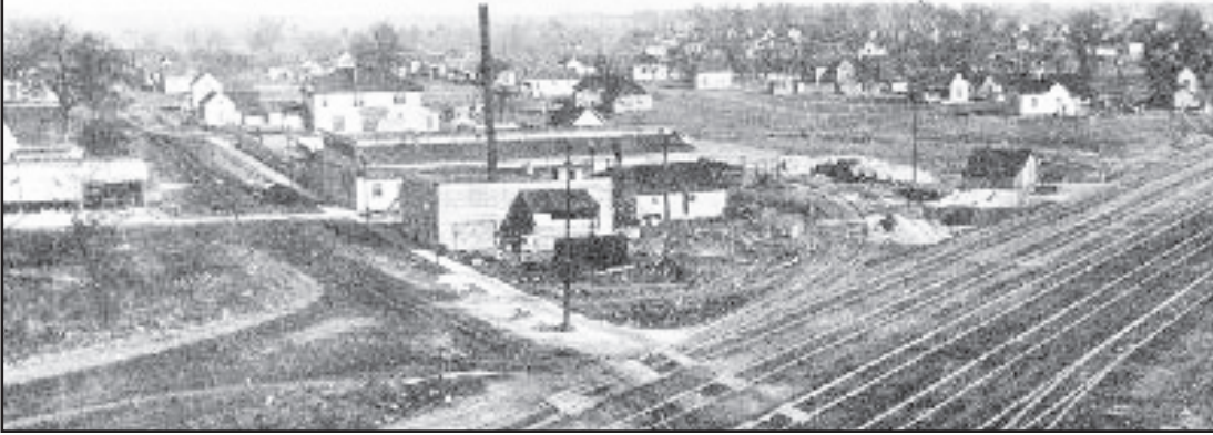
View of Villa Grove looking northwest from the top of the water tower.