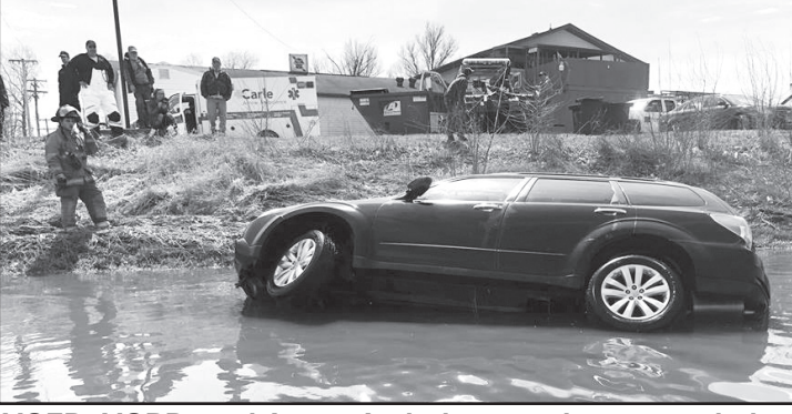
VGFD, VGPD, and Arrow Ambulance units responded to the 100 block of East Harrison in Villa Grove to assist with a vehicle recovery. An unoccupied vehicle had rolled into the flood basin of the Embarras River and was submerged in approximately 5 feet of water. The Villa Grove rescue boat was deployed to rig up the tow cable on the submerged vehicle.