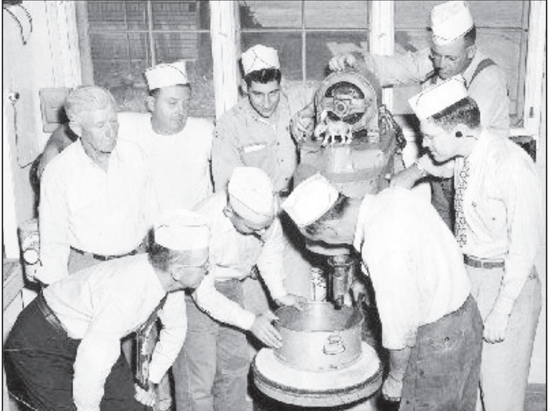
Cooks at the 1948 Pancake Festival.