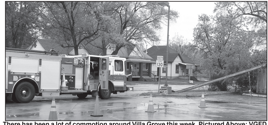
There has been a lot of commotion around Villa Grove this week. Pictured Above: VGFD Assists with downed power line by Circle K in Villa Grove.