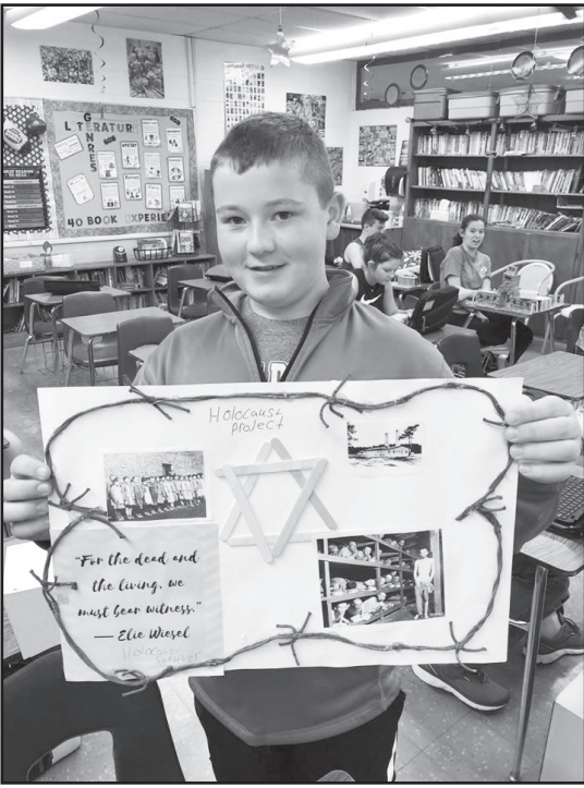
Villa Grove 8th Graders work hard to present their Holocaust projects.