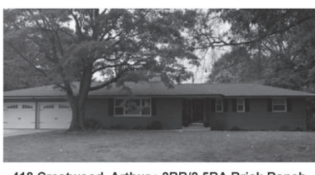
418 Crestwood, Arthur • 2BR/2.5BA Brick Ranch 1 Acre in Town, Park Like Setting

Stop by Office or Check our website www.legacylandco.com to see our other listings www.legacylandco.com Legacy Land Co. 900 E Columbia, Arthur, IL 61911