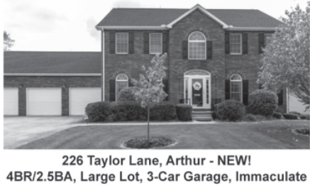
226 Taylor Lane, Arthur - NEW! 4BR/2.5BA, Large Lot, 3-Car Garage, Immaculate