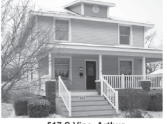
517 S Vine, Arthur 4BR/2BA, 2-Car Garage, Great Location