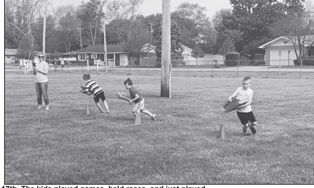
Villa Grove Elementary students enjoyed spending the day outside for field day on May 17th. The kids played games, held races, and just played.