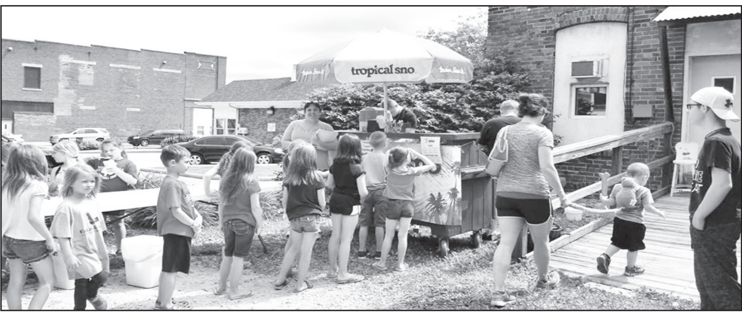
Photo on Left and Photo Above: Camargo Township District Library held there first summer reading of the month on June the 4th. They had over 80 children in attendance.