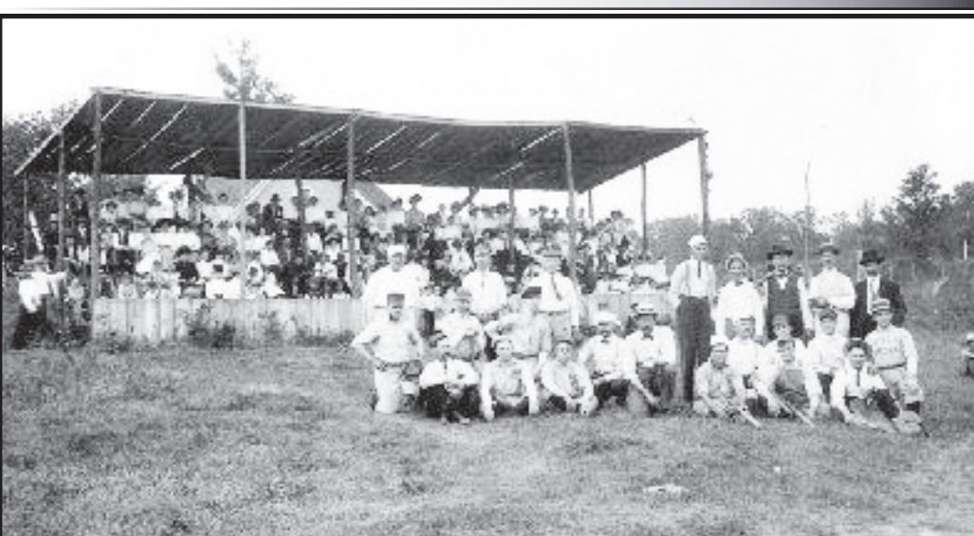
Villa Grove Businessmen's baseball team, 1909.