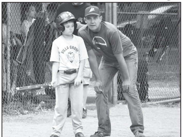
The summer baseball season is underway. Photo on Left: Villa Grove State Bank team played at Henson Park against Arcola. Photo on Right: The Scoop team plays against Sullivan at Henson Park.