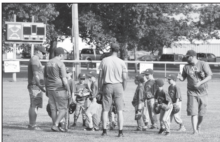
Villa Grove Coach Pitch Vs. Lovington.