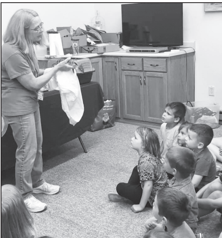
Summer reading at the CTDL is still in full swing, the kids enjoyed a visit from Scovill Zoo