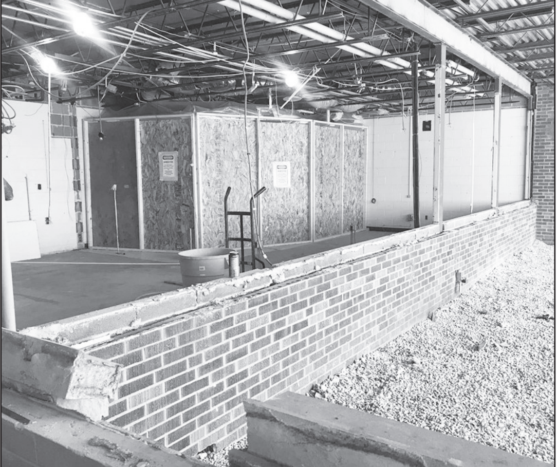
An inside look at Villa Grove Schools makeover to the front office. Looking from book-keeping office all the way through to former office north wall.