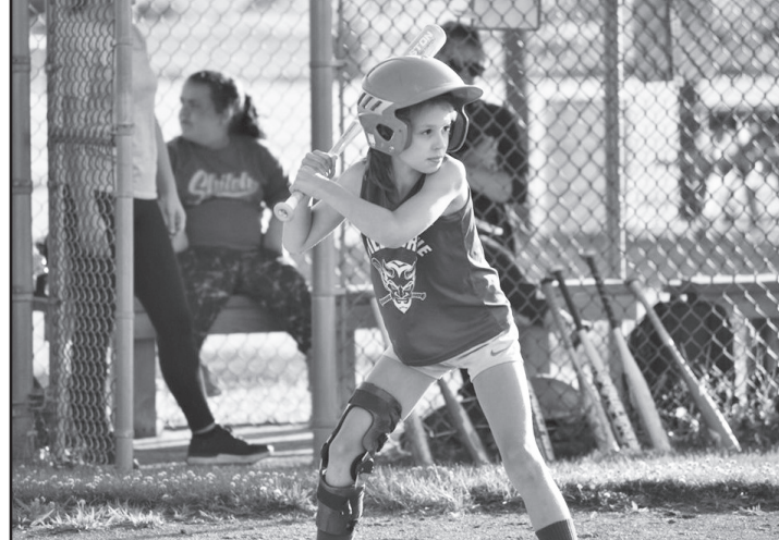
Summer Rec Girls Coach Pitch Team hits the fields at Richman Park.