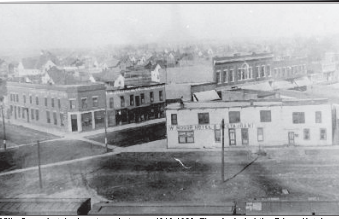
Villa Grove hotels downtown between 1910-1920. They included the Frisco Hotel and Lunchroom, McMillens Hotel and Restaurant and Windsor Hotel and Restaurant.