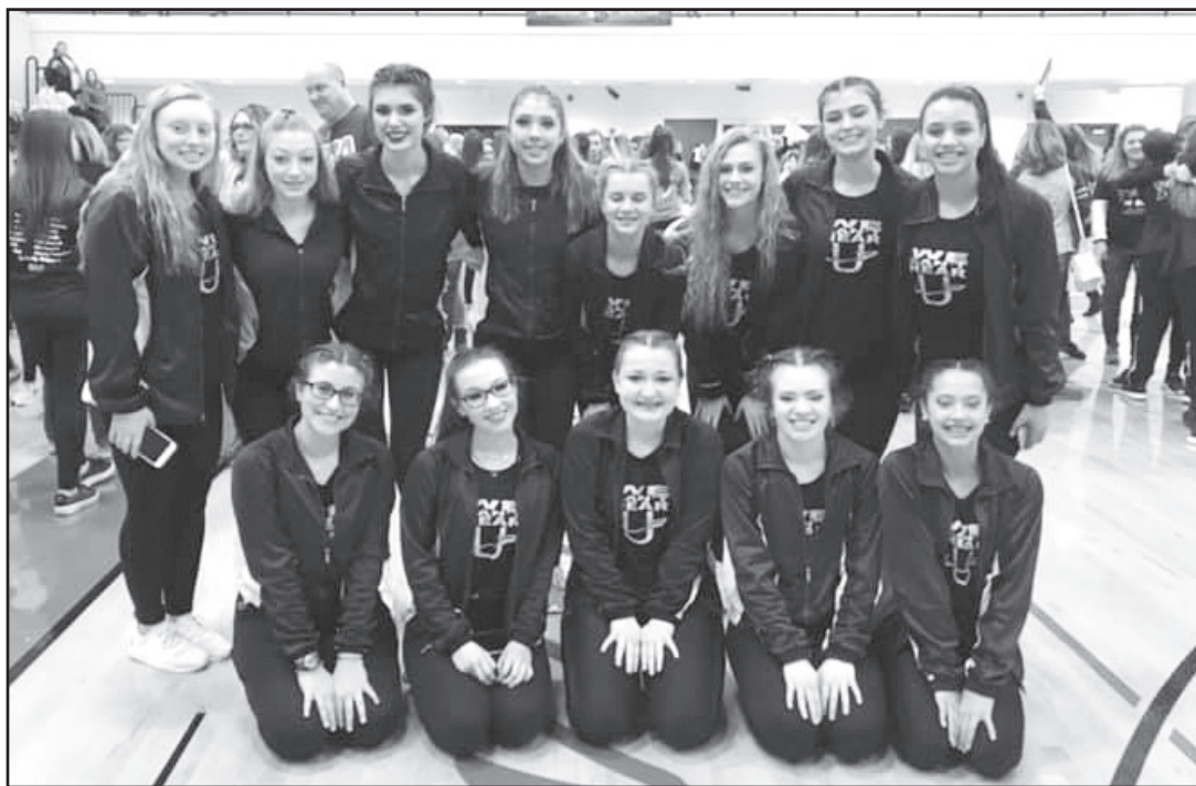
The Unity Rockettes Dance Team will be heading to IHSA Semi Finals on Friday, January 25 in Bloomington, IL to compete for the State Title after placing 3rd in the State Sectionals Saturday, January 19 in Mascotah, IL.