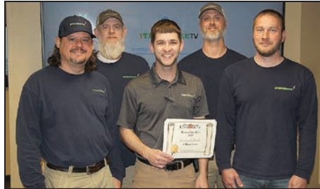
1st - 1 Tennessee 2nd - Gibson Connect 3rd - DirectTV