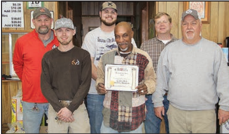
1st - Lashlee-Rich Building Materials 2nd - BR Supply 3rd - City Lumber Co. - Dyer