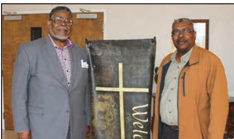
1st - Lane Chapel CME 2nd - Church at Sugar Creek 3rd - Harvest Church