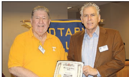
1st - Rotary 2nd - Junior Auxiliary of Humboldt 3rd - Exchange Club