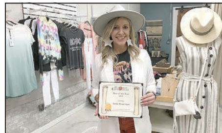
1st - Savvy Beautique 2nd - Peppermint Pony 3rd - Creative Accents