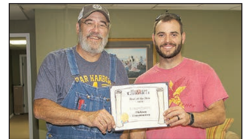
1st - Dickson Construction 2nd - Williams & Williams Construction Co. 3rd - Blalock's Remodeling