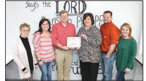
1st - Helping Hand of Humboldt 2nd - Mustard Seed 3rd - Relay for Life