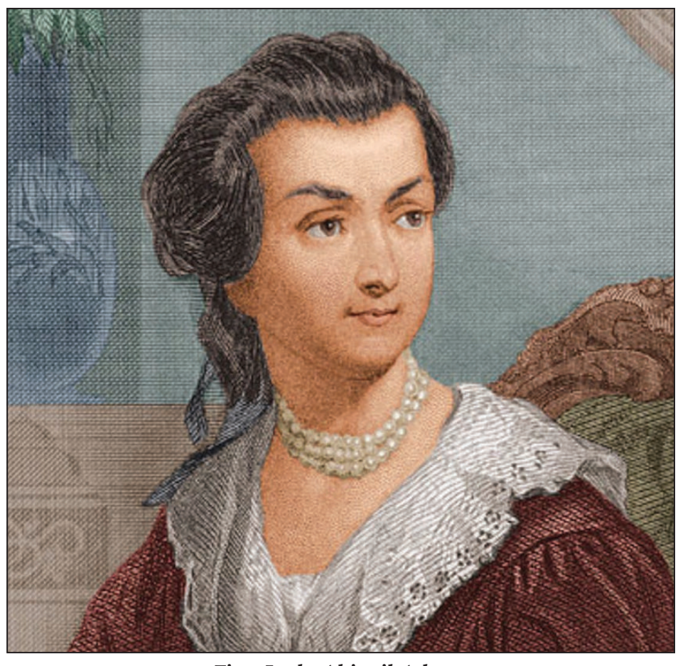
First Lady Abigail Adams

Abigail Adams would have approved of the life of women of today, pursuing education, entering the workplace, and especially voting.