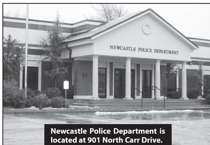
Newcastle Police Department is located at 901 North Carr Drive.