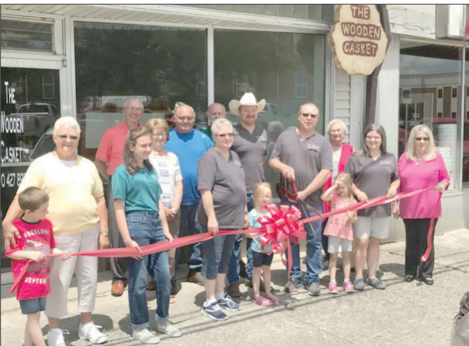
The Wooden Casket opened its doors in downtown Tompkinsville, offering beautiful, custom caskets at reasonable prices.