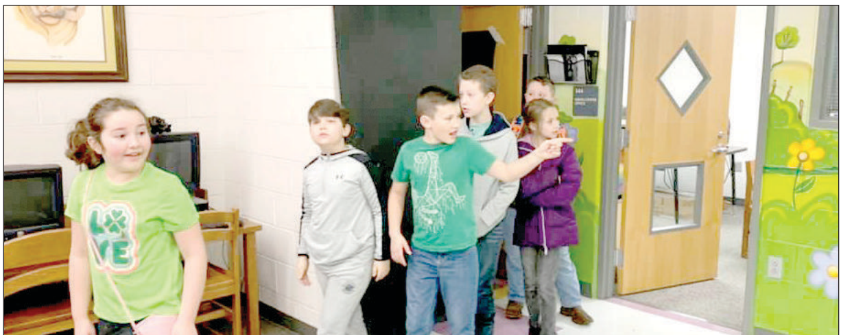
Last week GES Students got the first glimpse of the library make-over at Gamaliel Elementary School.