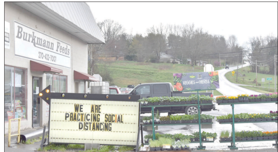
Many businesses like Edmonton's Burkman Feeds are committed to following the CDC's recommendations for the sake of public health.