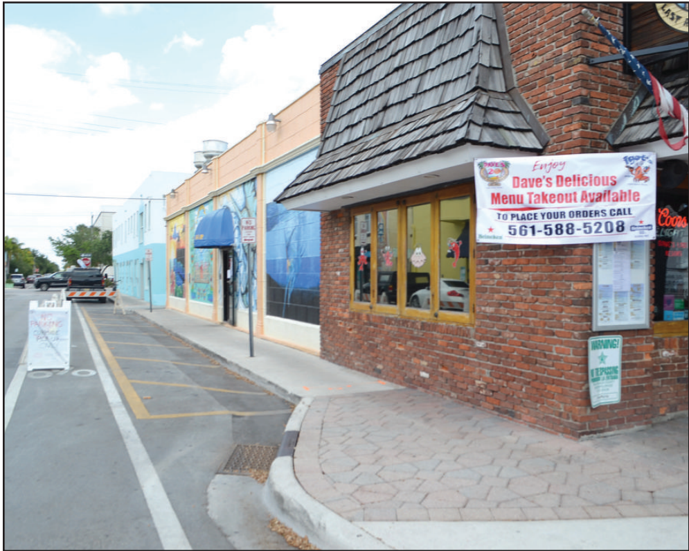
Dave's Last Resort & Raw Bar

tougher and they may have to start laying some off to be able to keep the doors open Check to see if your favorite restaurant is doing the take-out thing and support them if they are.