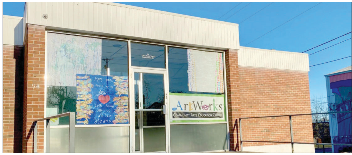
The new ArtWorks on Main.