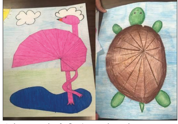
A class example of a flamingo and a turtle.

Students presented their commercials, and through the process of creating and sharing, learned the challenges of persuasive advertising.