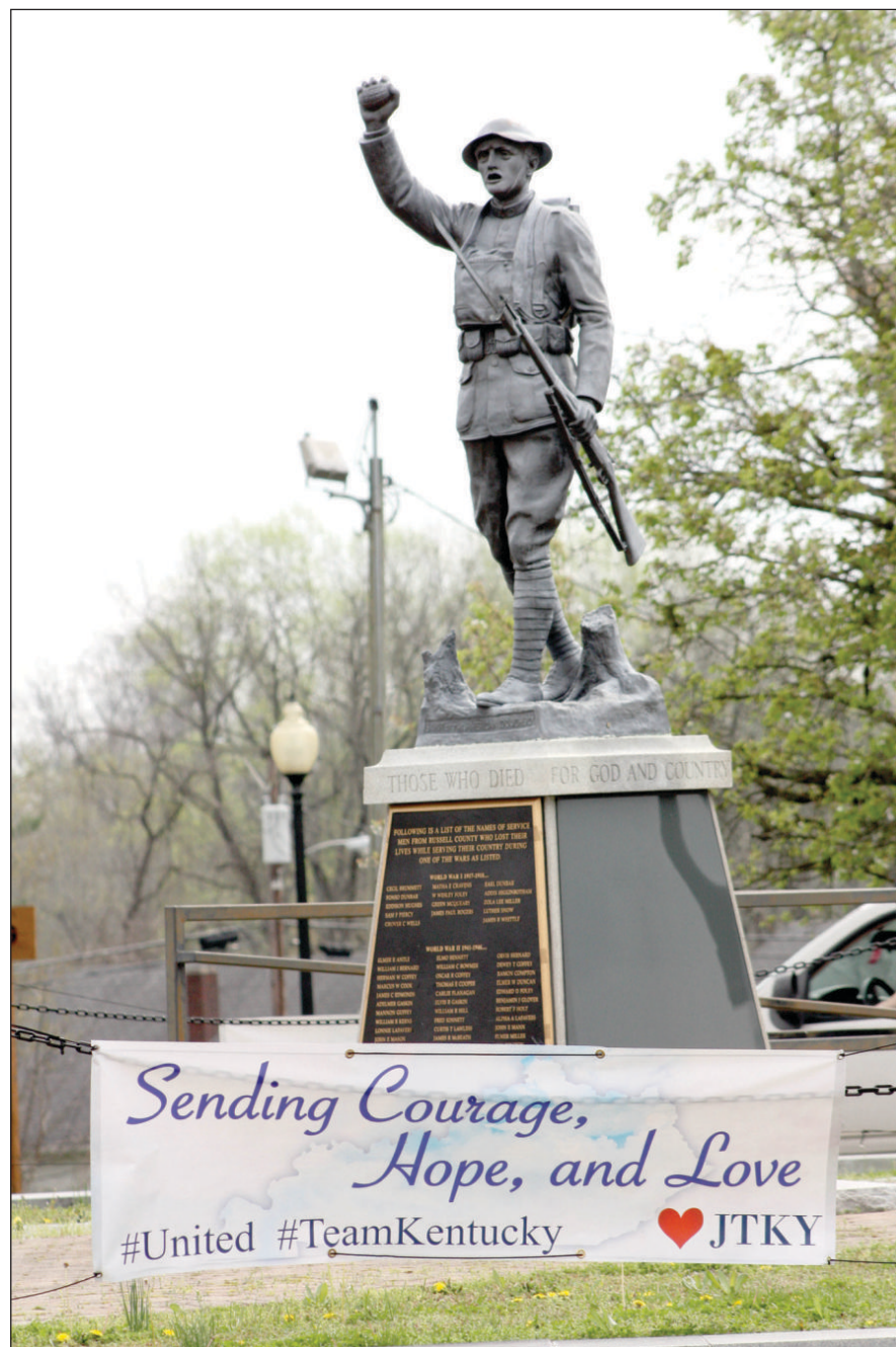
The City of Jamestown placed banners on the Doughboy Monument in the center of town last week to express an encouraging message for all citizens facing the COVID-19 crisis.