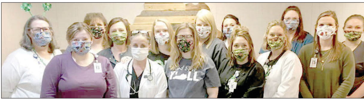
Russell Co Hospital Family Practice Associates- Plus Lab