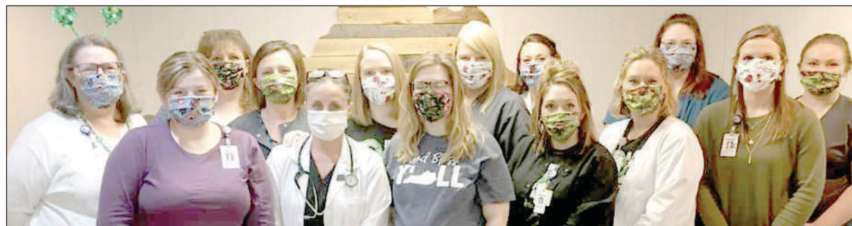
Russell Co Hospital Family Practice Associates- Plus Lab