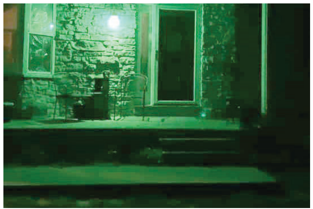
The Burton house shines bright with Green Lights.