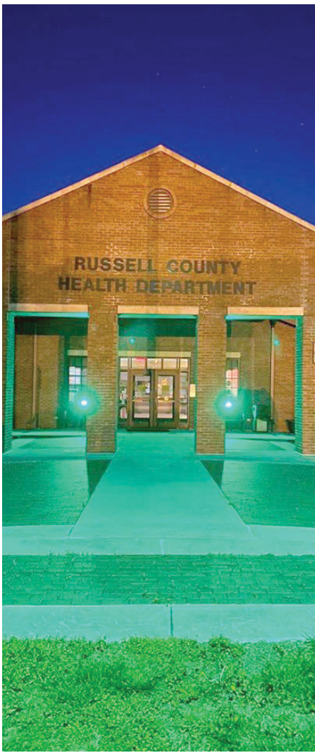
Russell County Health Department.