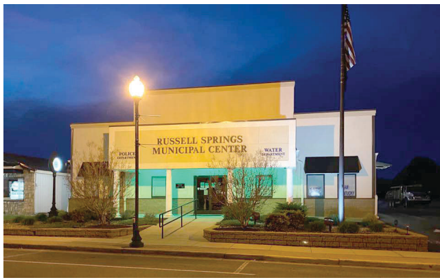
Russell Springs City Hall lit Main Street up Green. Governor Beshear showed this image during one of his meetings on TV