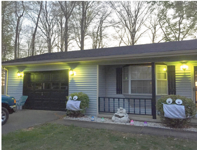
The Frazier House in Jamestown light their house up Green for COVID19 and also mask up their shrubs!