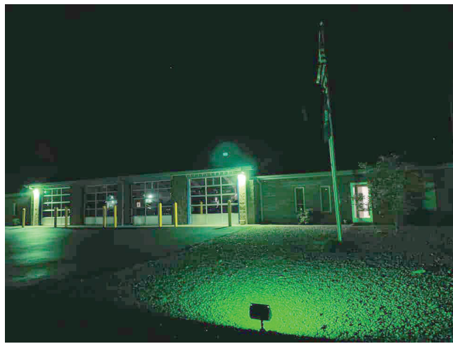
Russell County EMS supporting the families that have lost loved ones from the Coronavirus