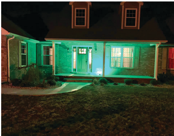
The Matney Family shines their bright green light.