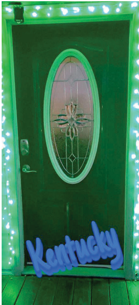
The Reeder household is about Kentuck during times like this