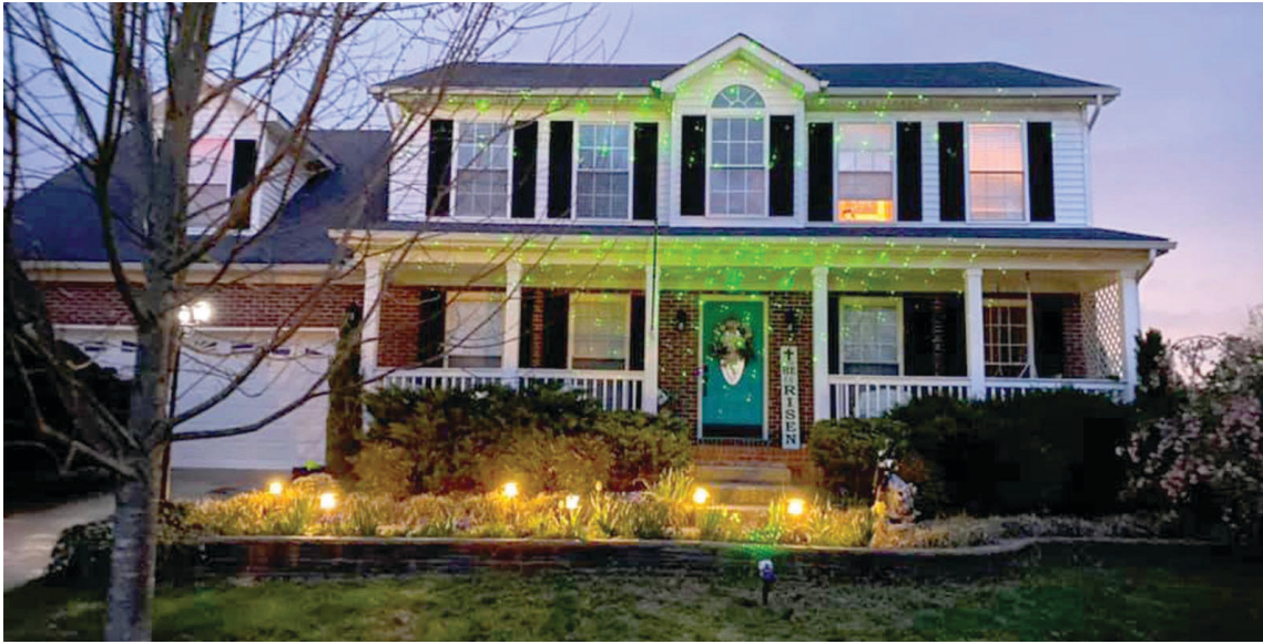
The Tubb Family honoring lost lives.