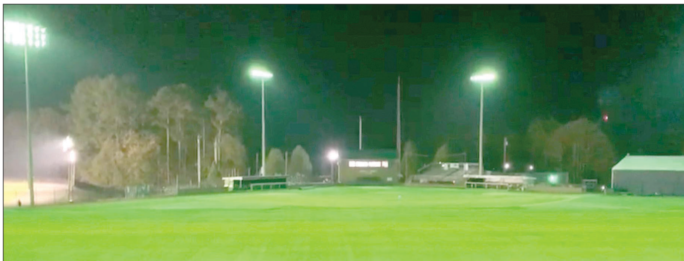
Lighting up the Russell County Laker field on April 8 for 20 minutes and 20 seconds for the 2020 Seniors

Kentucky Governor Andy Beshear is asking everyone in Kentucky to light their homes, neighborhoods and businesses in green to remember those who lost their lives to COVID-19. Take a look around homes and business of Russell County to see how they are honoring those who have passed!