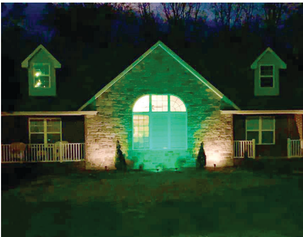
The Skaggs Family is happy to shine the bright green light for lives lost.