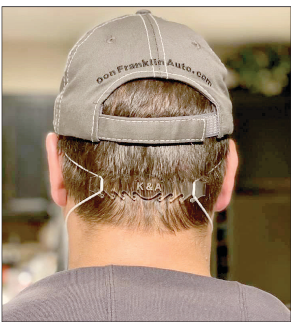
K&A Mask Extender in use.

during a worldwide pandemic whether it's a trip to the grocery store, the bank, or even a doctor's office, most people will be wearing a face mask or face protection of some kind.