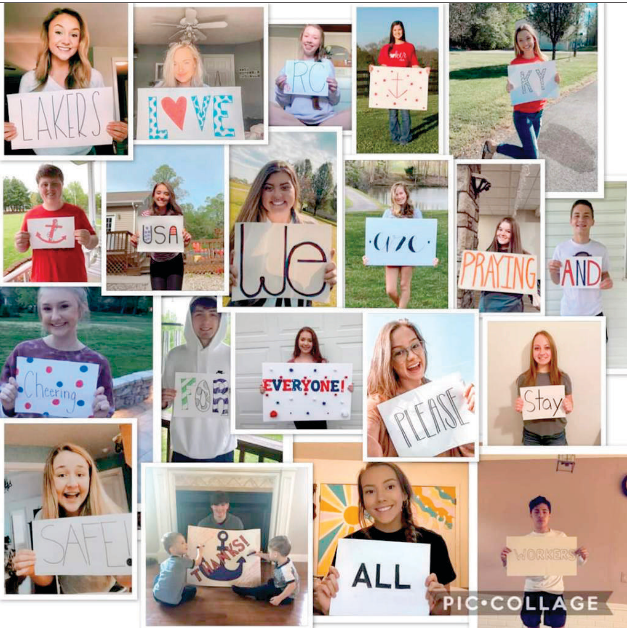
Russell County Cheerleaders Staying Positive During COVID19 Pandemic.