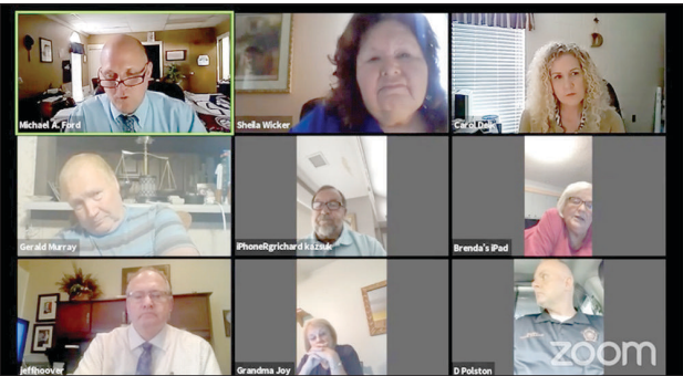
Russell County School Board met via e meeting on Zoom.