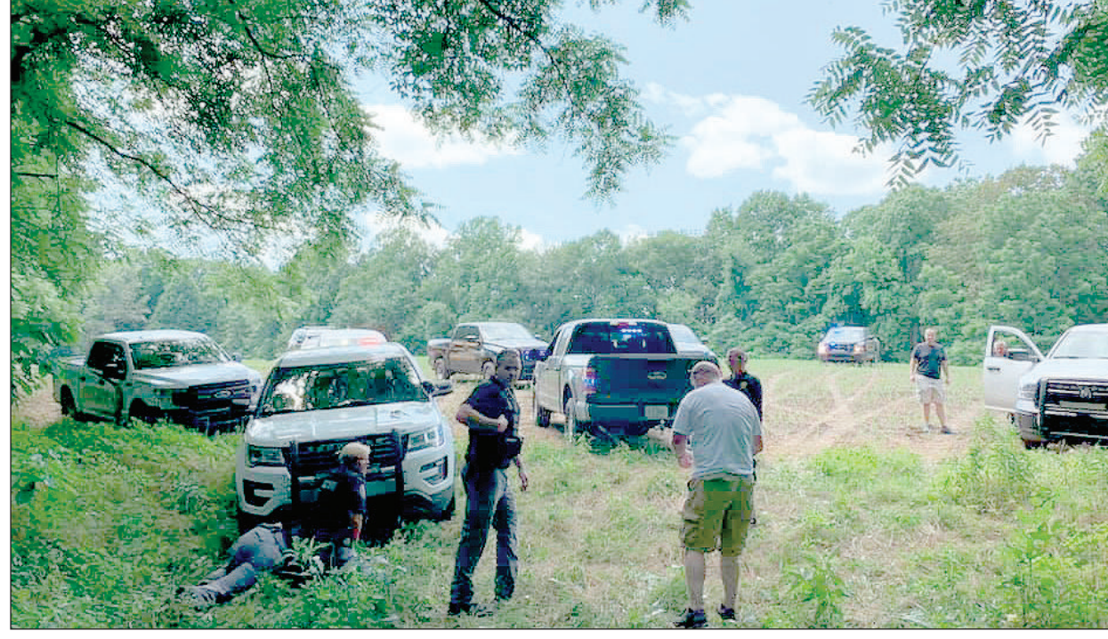
Law enforcement officers from multiple agencies converged on the scene of a pursuit which led authorities through woods, over creeks, and across fields in rural Russell and Adair Counties Friday.

Authorities said the driver exited a car parked at a convenience store "and left it running and unoc-