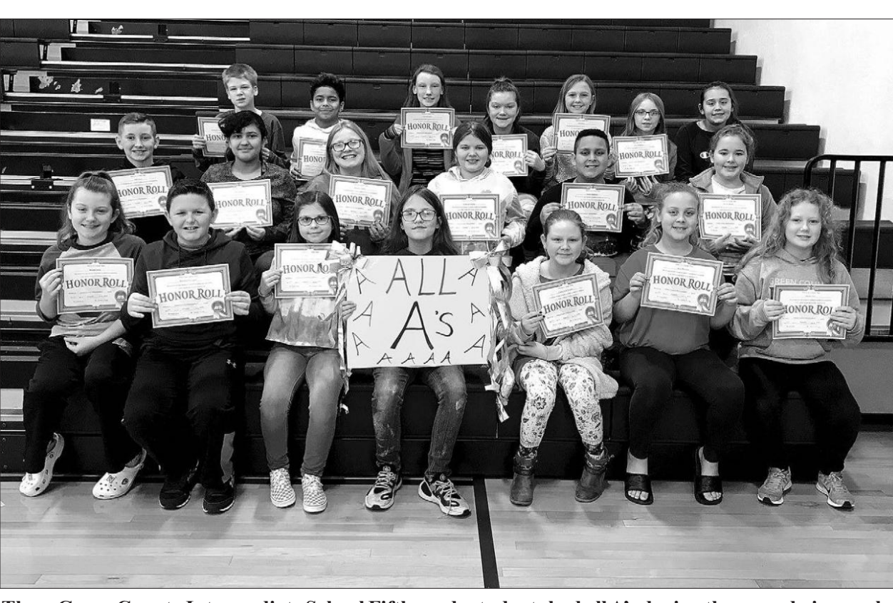
These Green County Intermediate School Fifth grade students had all A's during the second nine weeks.