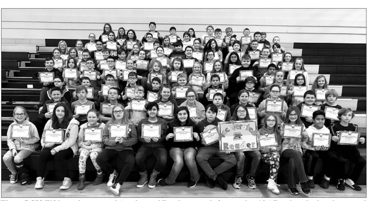
These GCIS Fifth graders earned Accelerated Reader awards for earning {f 10\,AR} points during the second