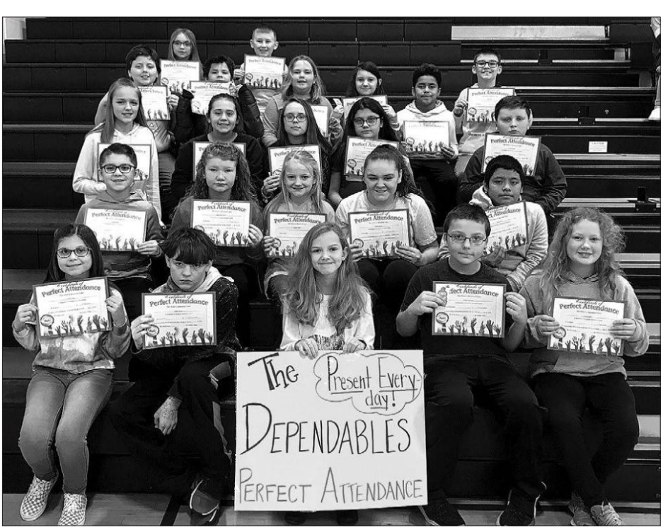
These GCIS fifth grade students had perfect attendance during the second nine weeks.