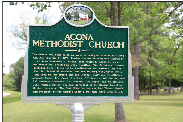
This historical marker was dedicated last year during homecoming at Acona United Methodist Church.

The church does have heating units for the winter, but during the Delta summers, it gets by with a ceiling fan