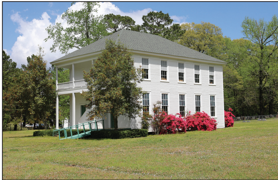
Acona United Methodist Church was built in the 1870s and occupies a spot on the National Register of Historic Places along with its cemetery and the former Acona School building nearby.