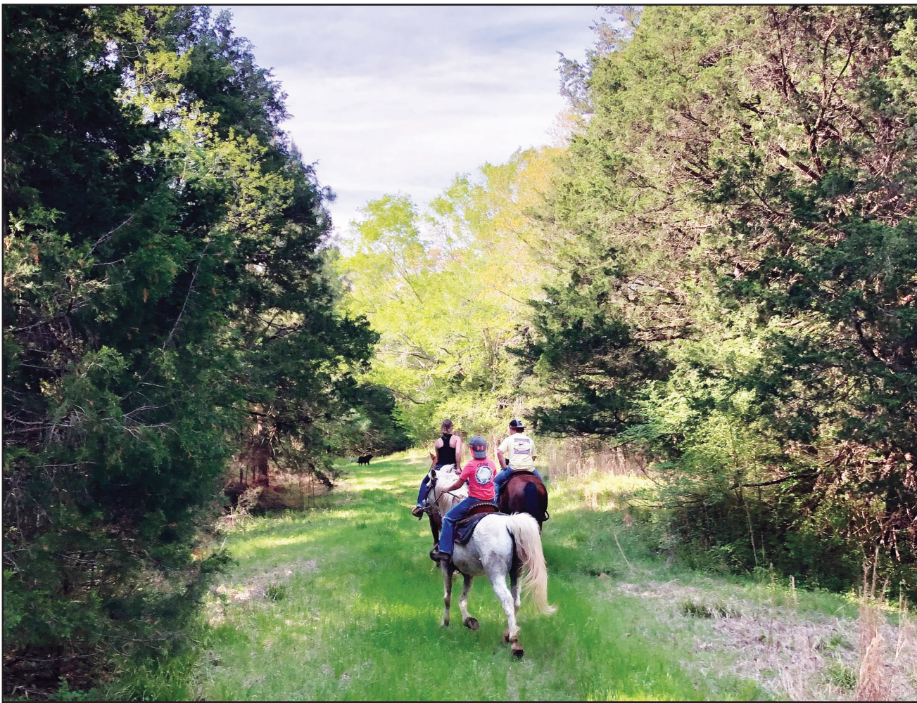
Pictured above, Livi, Colton and Orin Howell (pictured on white horse), all of Coxburg, have been riding horses most everyday to get ready for summer 4-H horse shows.