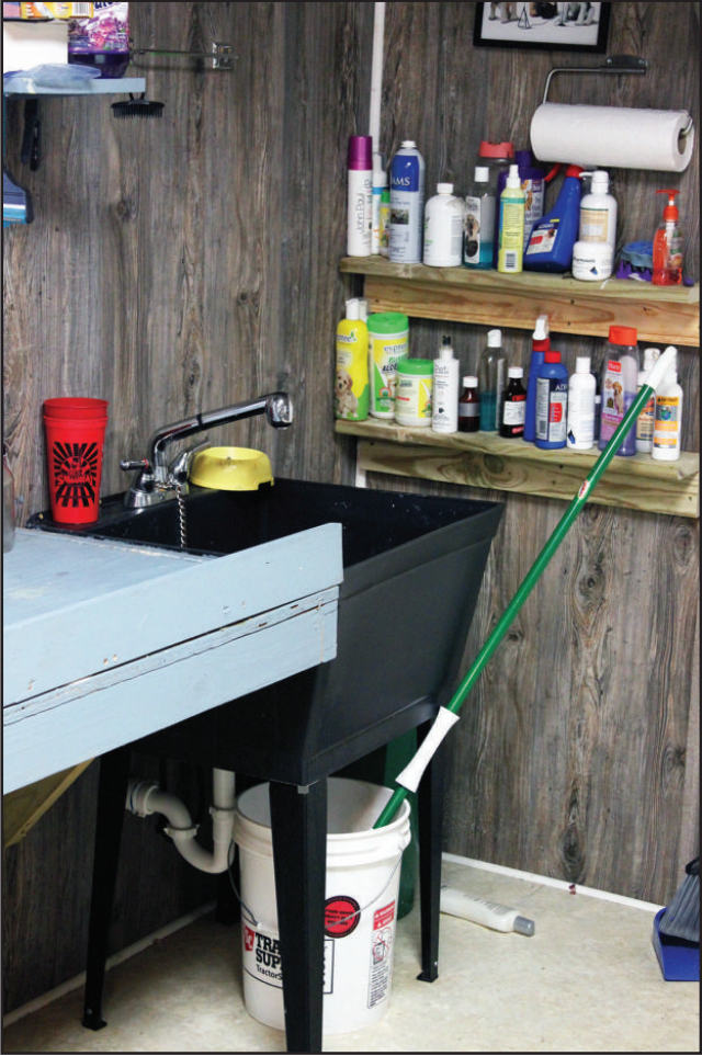
Pictured above, an animal washing and grooming station is ready to be used for strays that are brought in by JSBAR for care and transport. Ultimately, to a permanent home.