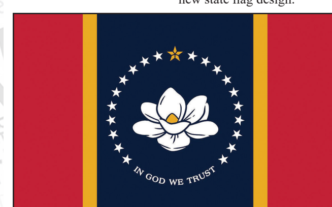
Voters will decide on November 3, Election Day, for or against House Bill 1796 - Flag Referendum, granting a new state flag to Mississippi.

Ballot Measure 3: House Bill 1796 - Flag Referendum, vote yes or no on the new state flag design.