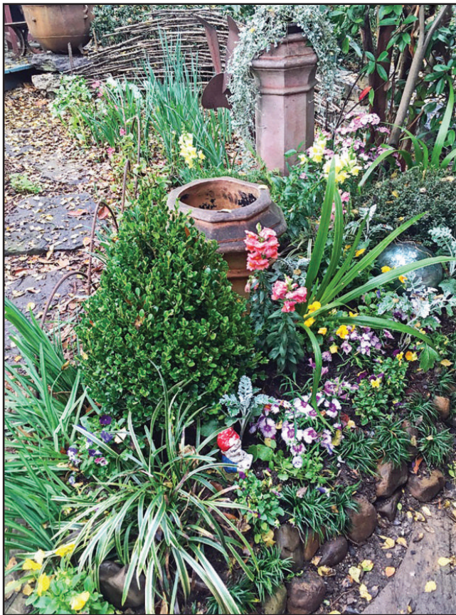
A slice of England in Mississippi.

“It’s a sad situation because we’ve got two losses on both sides of the families,” he said. “I still think it’s important that people put guns up, and this is a prime example. Even though you’re of age, you still don’t properly know how to handle a gun.”