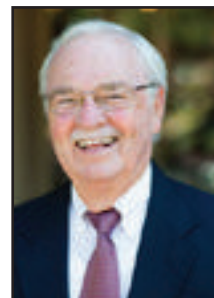
Special to The Clinton Courier

Constructions of new homes along Pinehaven make