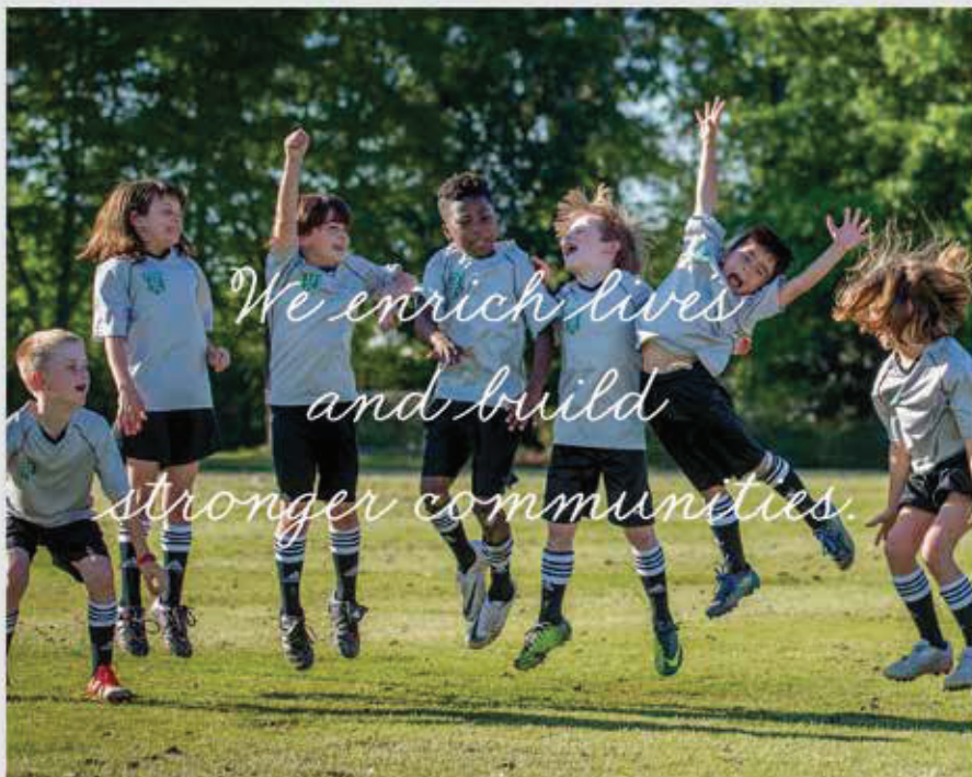
© Copyright 2018 BankPlus Member FDIC

Commitment to community is one of our core values.