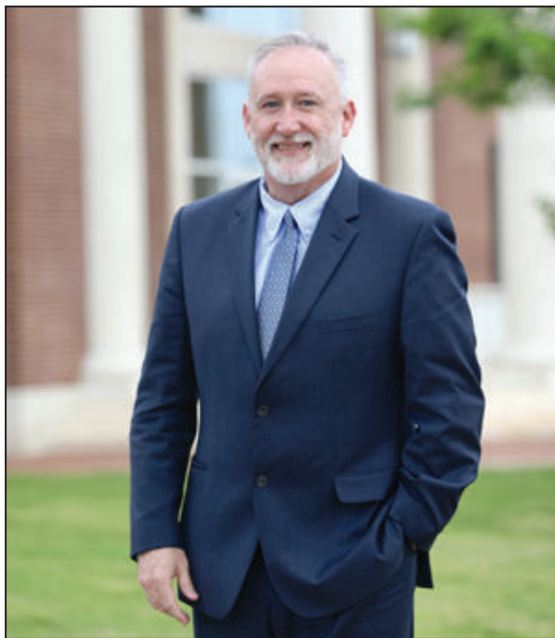
Special to The Clinton Courier