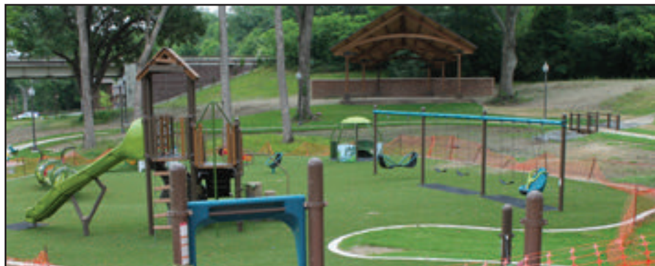
Special to The Clinton Courier

A Grand Opening will be held for the new Lions Club Park on Friday, May 27, at 10 a.m.