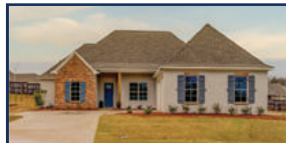
171 Catherine Blvd. - $334,250