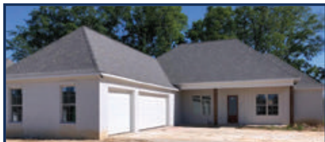
190 Catherine Blvd - $351,150