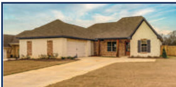
102 Twain Trail - $345,500