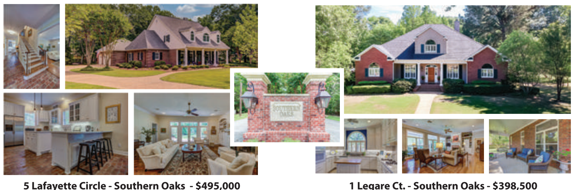
5 Lafayette Circle - Southern Oaks - $495,000

The U.S. Presidential Scholars Program was established in 1964, by Executive Order of the President, to recognize and honor some of the nation's most distinguished graduating high school seniors. In 1979, the program was extended to recognize students who demonstrate exceptional talent in the visual, creative and performing arts. In 2015, the program was again extended to recognize students who demonstrate ability and accomplishment in career and technical education fields.