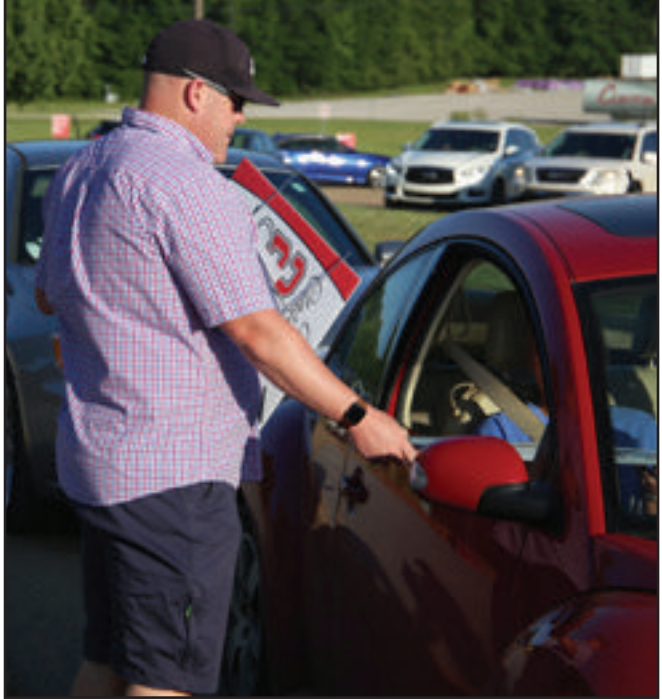
Special to The Clinton Courier