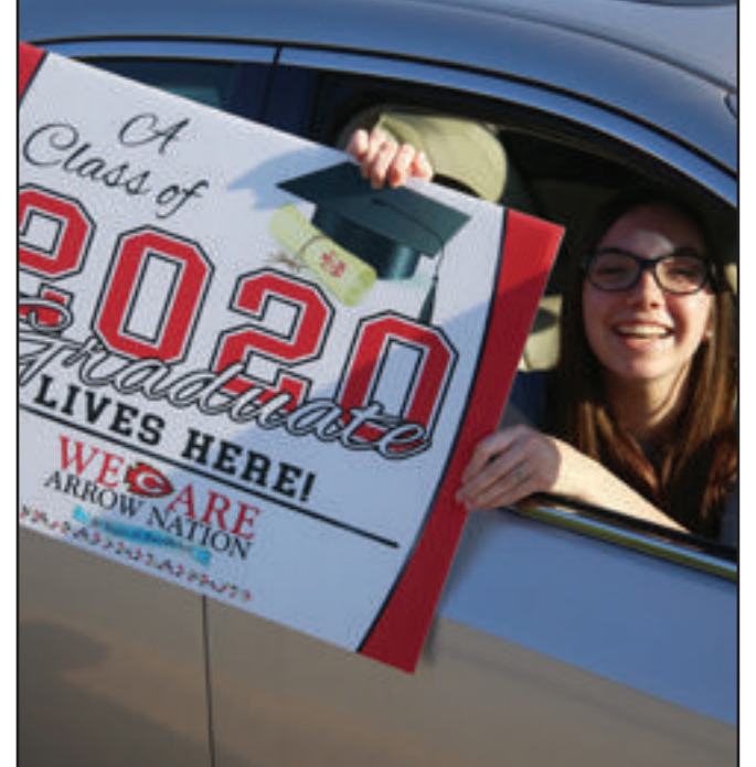
Special to The Clinton Courie