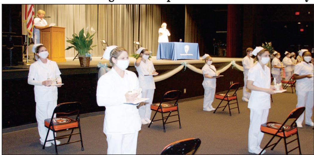
The Practical Nursing Department at the Waynesville Career Center holds summer graduation in June 2020.

ing engineering, the sciences, business and information technology education, the humanities, and the liberal arts. Missouri S&T is known globally and is highly ranked for providing a high return on tuition investment, exceptional career opportunities for graduates, and an emphasis on applied, hands-on learning through student design teams and cooperative education and internship opportunities. For more information about Missouri S&T, visit www.mst.edu .