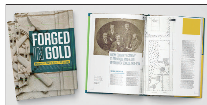
New Missouri S&T history book.

We invite you to join us for Adult Sunday School at 10:00 and Worship at 11:00.