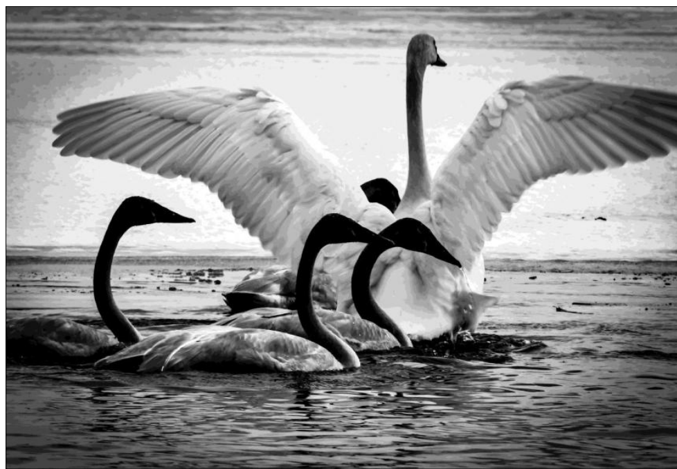
Swanlife, photograph by Bob Kovar, BK Photography, Manitowish Waters. While his studio will be closed, Bob will offer online viewing and sales during the tour.

The artist members of Northwoods Art Tour will be welcoming visitors in a variety of ways this July 24, 25 and 26. The 39 studios and three guest artists each made individual decisions regarding their ability to safely be open to the public during the current COVID-19 pandemic. Open studios will welcome visitors from 10 a.m. - 5 p.m. each day. A status list of all the studios with links to their contact information including webpages is available on the Northwoods Art tour website: