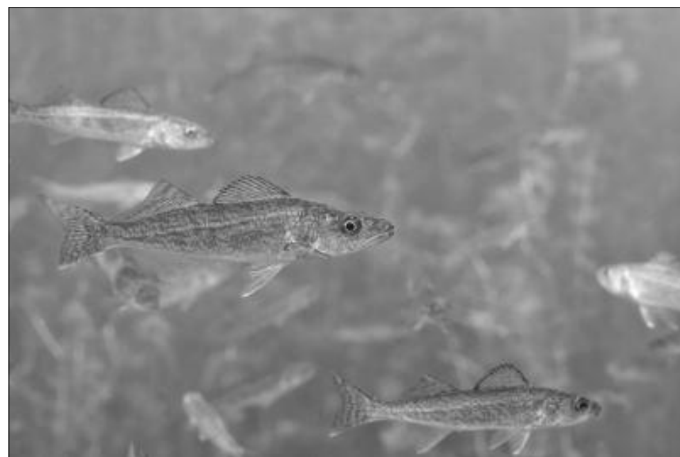
A young walleye. Stocking began working after the bullhead population was reduced.