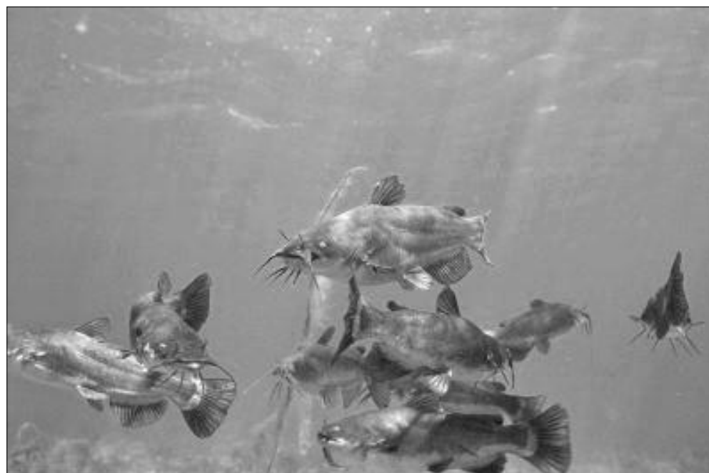
Black bullheads were outcompeting walleyes for important forage at critical times when walleyes need an abundance of specific-sized food.

Keeping walleye lakes healthy and productive is an ongoing issue, and all lakes face their own unique challenges. Overall, there likely aren’t a great number of walleye lakes affected by bullhead populations, but where such lakes exist, Mike Preul’s pioneering work is one silver bullet that fisheries managers can now add to their arsenal.