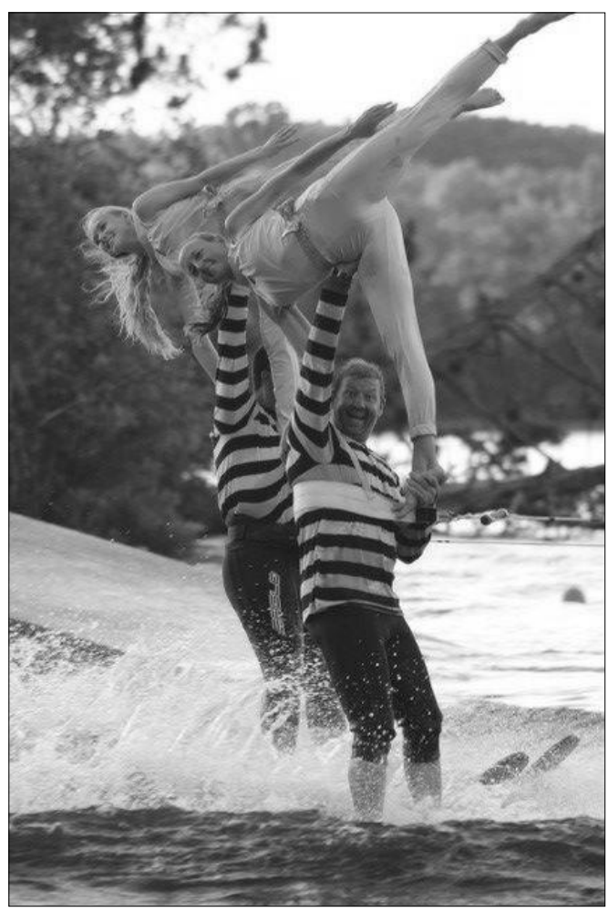
Ski-ters placed second in Division II at the Wisconsin State Water Ski show competition in July 2019 in Wisconsin Rapids for jumping and comedy.

audience and also no interaction with people during intermission."