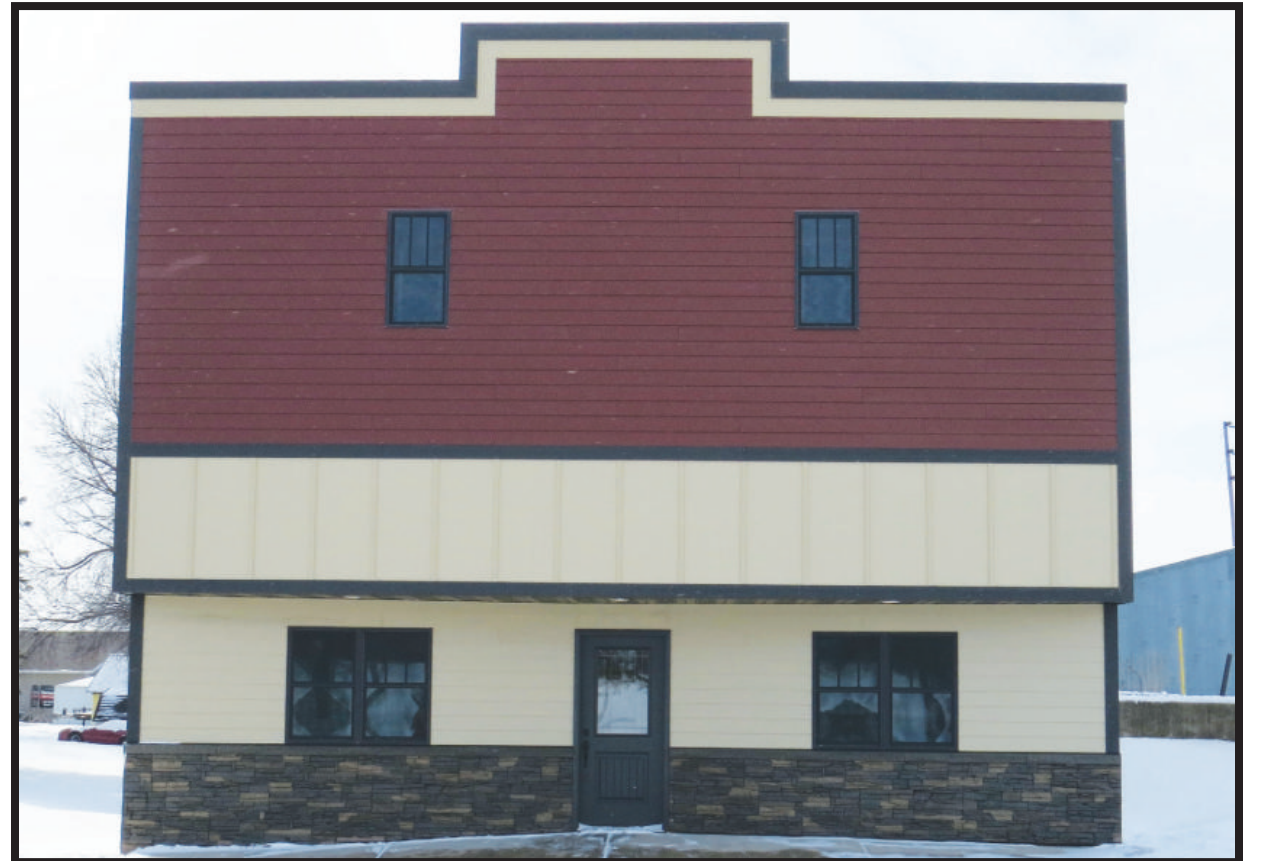
The new look of the Hawley Herald was done in 2014.