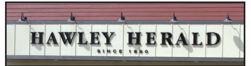
The new sign was installed in 2015.

up, which continually threatens the future of small town newspapers.