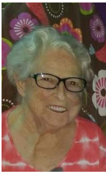
Burial was in Lesterville Memorial Cemetery.

Graveside services were held Tuesday, February