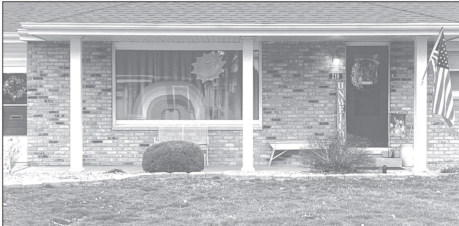
Tuscola residents continue to spread cheer by decorating their windows for all to see. Please visit the Tuscola Window Hunt Facebook page for more details and window themes.