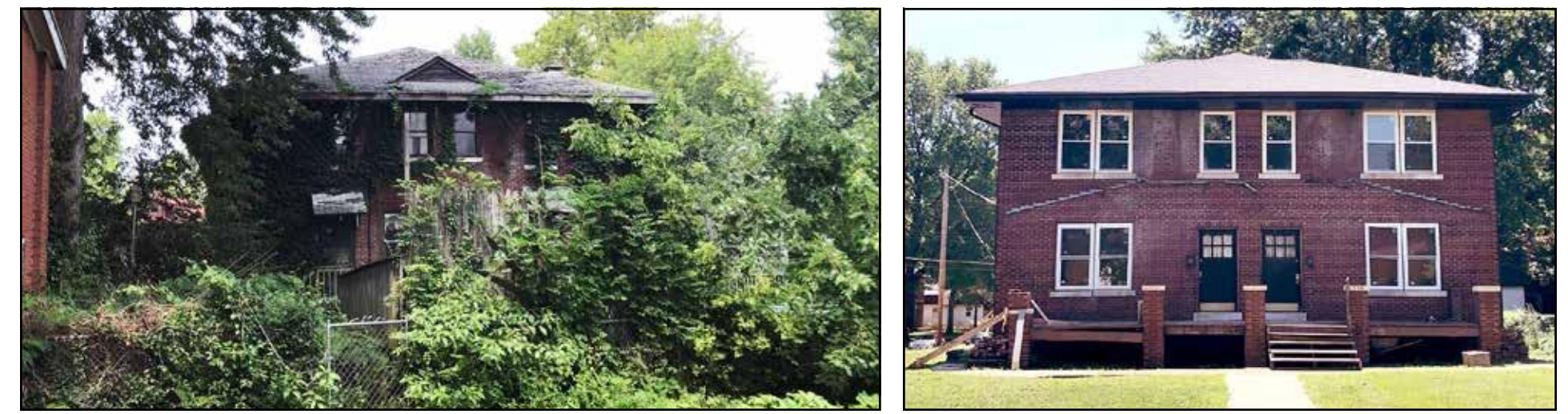
Before (left) and after scenes of the duplex at 710/712 E. D St. show the remarkable progress.

The first property associated with the city of Belleville's Infill Redevelopment Program is making a substantial impact on its East D Street neighborhood.