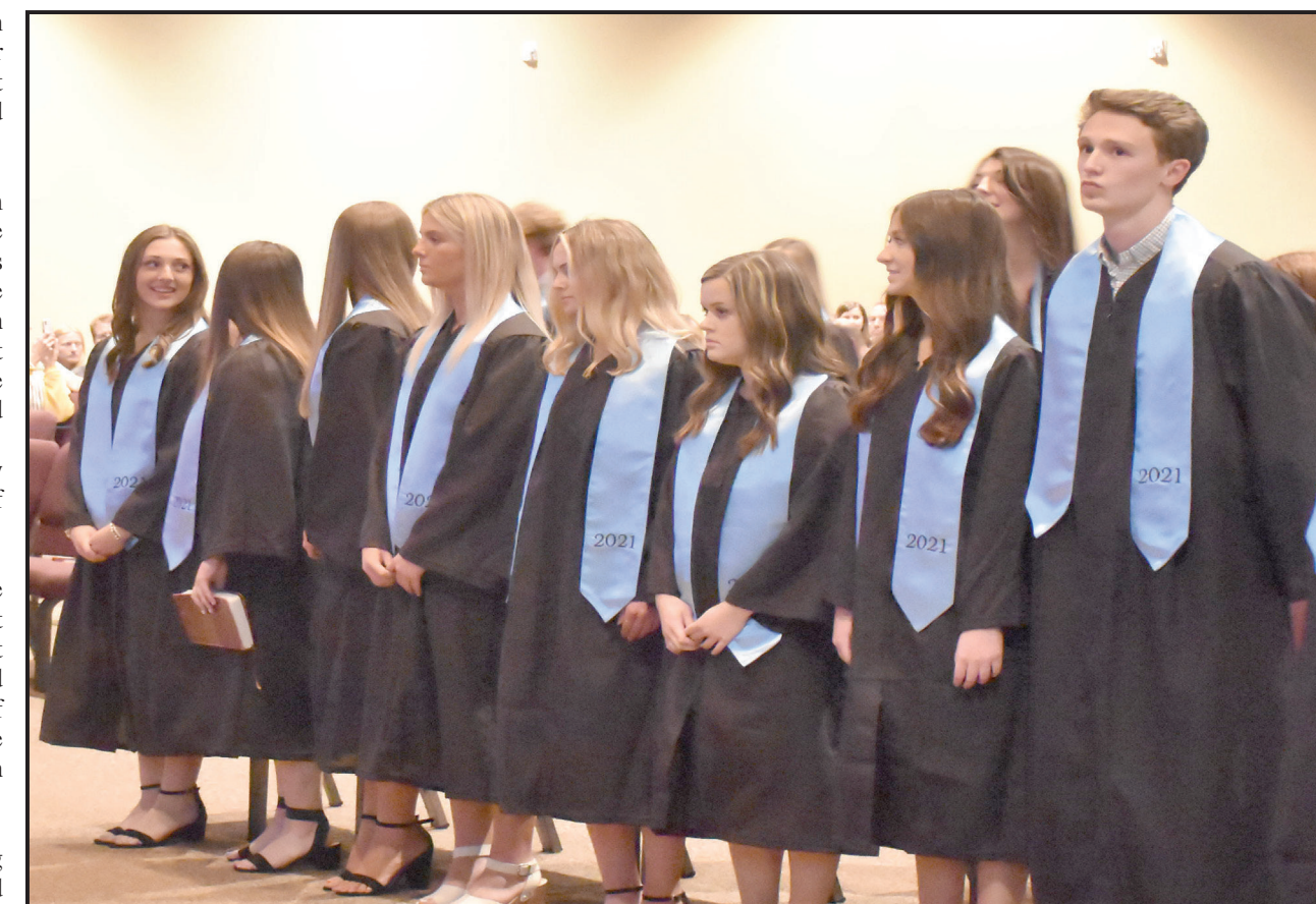
2021 GRADUATES line up at the beginning of the South Gibson County High School Baccalaureate service hosted by Chapel Hill Baptist Church on Tuesday night, May 11.