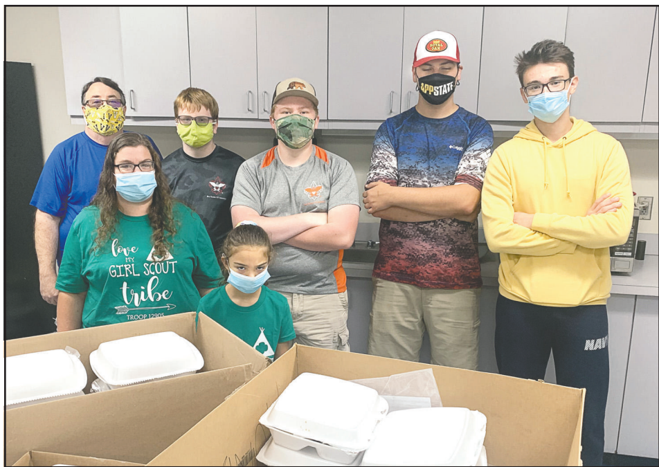
SCOUTS SERVING UP BARBEQUE — Bethlehem Boy Scouts and Girl Scouts are shown above at Mt. Pisgah Lutheran Church October 9, 2021, with prepared barbeque plates. The 600 plates raised over $6,000 for the troops.