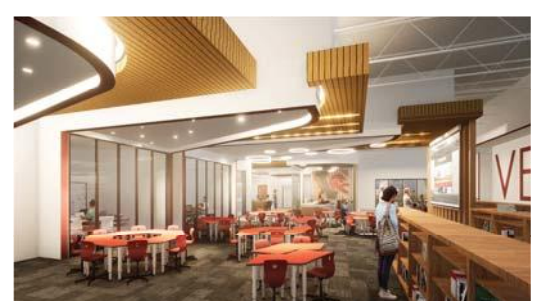
High School Media Center