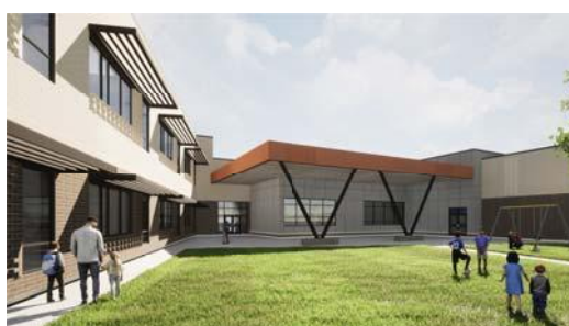
New Elementary School Courtyard