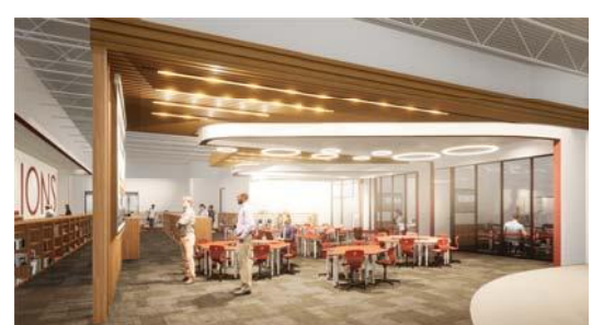
High School Media Center

FIND MORE INFORMATION AT VERNONISDBOND.COM