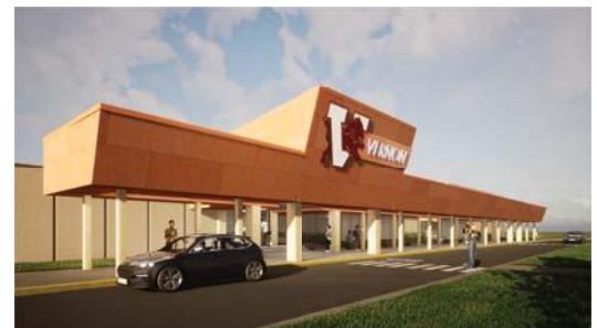
High School Entrance