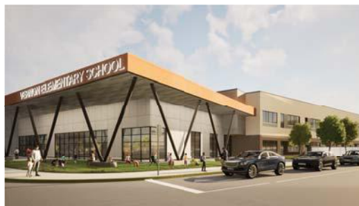
New Elementary School Entrance