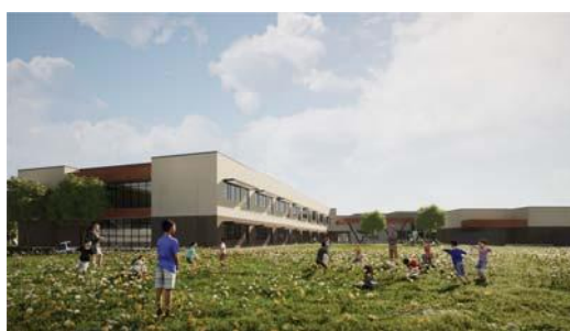
New Elementary School Courtyard