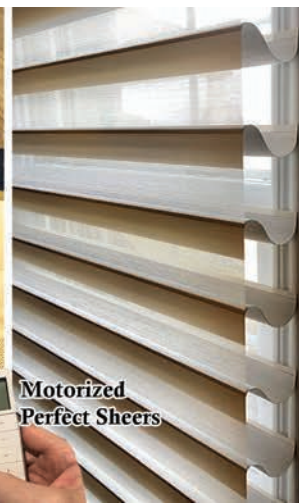
Motorized Perfect Sheers

Window Solutions Roman Shades Roller Shades (UV & Energy protection) Honeycomb Shades & Custom Designed Draperies, Pillows, Bedding and Designer Wallpapers!