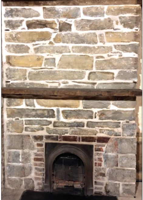
Before and After photos of a fireplace inside the building.