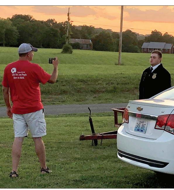
This year's FFA banquet was filmed and presented virtually, due to Covid-19.