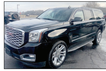
2017 Yukon XL

67,000 miles, 4x4, leather, loaded, heated and cooled seats, 3rd row seating, sunroof, new tires.