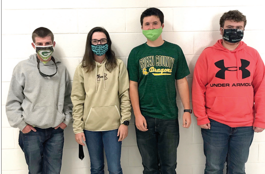
The 2020 State Winning Jr Dairy Judging Team.