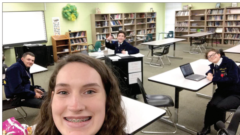
The Green County FFA Regional Ag Sales Team placed second in competition.